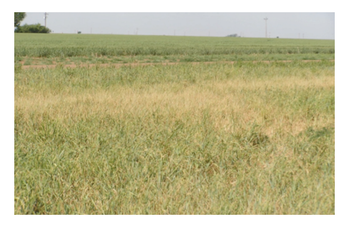
Figure 3. Early-sown, dryland wheat (foreground) with significant damage from WSMV and HPV. This is in contrast to the healthy late-sown, irrigated wheat field in the background.

Another potential pitfall commonly associated with wheat following corn is Fusarium Head Blight (FHB). Wheat farmers in the eastern and northcentral U.S. are acutely familiar with FHB and the devastating effects it can have on a wheat crop. Wheat farmers in the Southern Plains, however, have largely avoided this disease in the past.