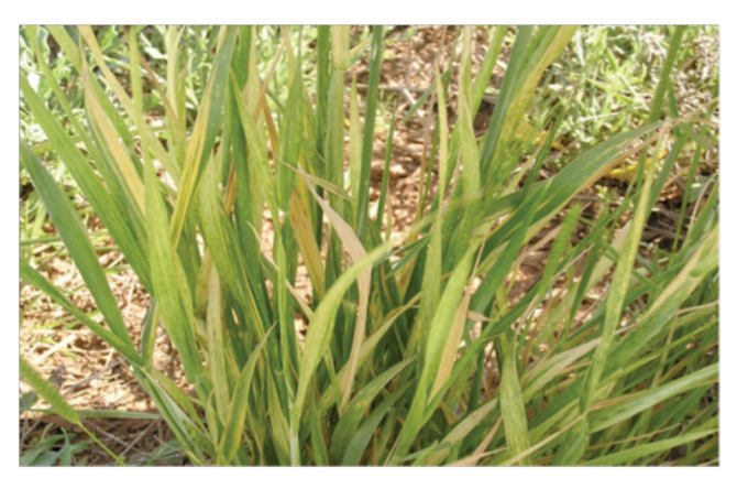
Figure 1. Wheat infected with Wheat Streak Mosaic Virus and High Plains Virus. Note the yellow mottling and streaking present on leaves.

Many wheat farmers are familiar with wheat streak mosaic virus (WSMV) & the high plains virus (HPV). WSMV and HPV are transmitted by the wheat curl mite. Mites and these viruses survive in crops such as corn, as well as many grassy weeds and volunteer wheat. In the fall, mites spread from these crops to emerging seedling wheat, feed on that seedling wheat, and transmit the virus to the young wheat plants. Effects of WSMV or HPV transmitted to wheat in the fall are devastating, as the wheat plant is either severely damaged or killed by the next spring (Figure 1). In fact, data from experiments conducted