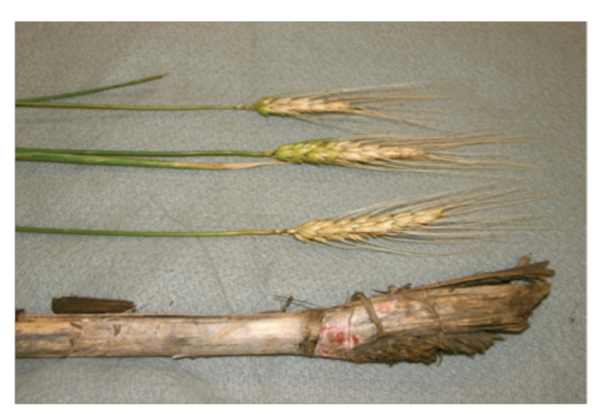
Figure 4. Fusarium growing on corn residue can serve as a source for infection of wheat heads during or after flowering. Note the pink Fusarium fungi growing on the piece of corn residue and the differing levels of Fusarium Head Blight occuring on the wheat heads.

Wheat is most susceptible to FHB at the flowering stage of development, although some infection can still occur after flowering. Air temperatures between 65 and 86° F and moist conditions favor reproduction of the fungus on crop residues and infection of the wheat crop. Having these environmental conditions during flowering are most likely in eastern Oklahoma and less likely west of I-35. A Fusarium Head Blight risk assessment tool is available at www.wheatscab.psu.edu and